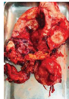
Figure 2: The resected specimen was a partial cystectomy specimen with perivesical fat and the median umbilical ligament.