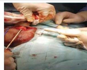
Figure 2: Drilling into the fibrous cavernous tissue.