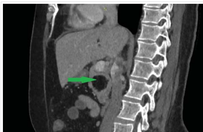
Figure 2: Lipoma of the head of the pancreas (green arrow).