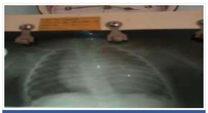
Figure 1: Chest Radiograph showing cardiomegaly (CTR-75%) of left ventricular dominance, right atrial dilatation and lung plethora.

The child was placed on intranasal O2, intravenous antibiotics, isoproterenol, and furosemide with pacemaker implantation and cardiac surgical evaluation kept in view. However, she remained oxygen-dependent and persistently bradycardic (40-60 bpm) throughout admission. Parents signed against medical advice after 1 week of admission despite adequate counseling.