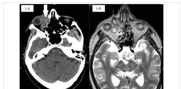
Figure 1: A: Non enhanced axial CT shows bone erosion of the papyracea lamina of ethmoid bone. B: Axial T2 weighted sequence shows an extraconal and intraconal mass (white arrows) in the right orbit, with non-homogeneous hyperintensity and irregular margins. The lesion involves the nasolacrimal canal, the papyracea lamina and the anterior ethmoid cells.

MRI scan substantiated a T2 mildly hypointense, T1 isointense mass with erosion of the inferior orbital wall.