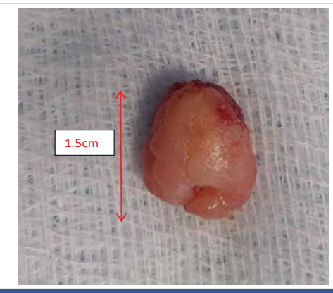
Figure 2: Transurethral resection of the papillary lesion