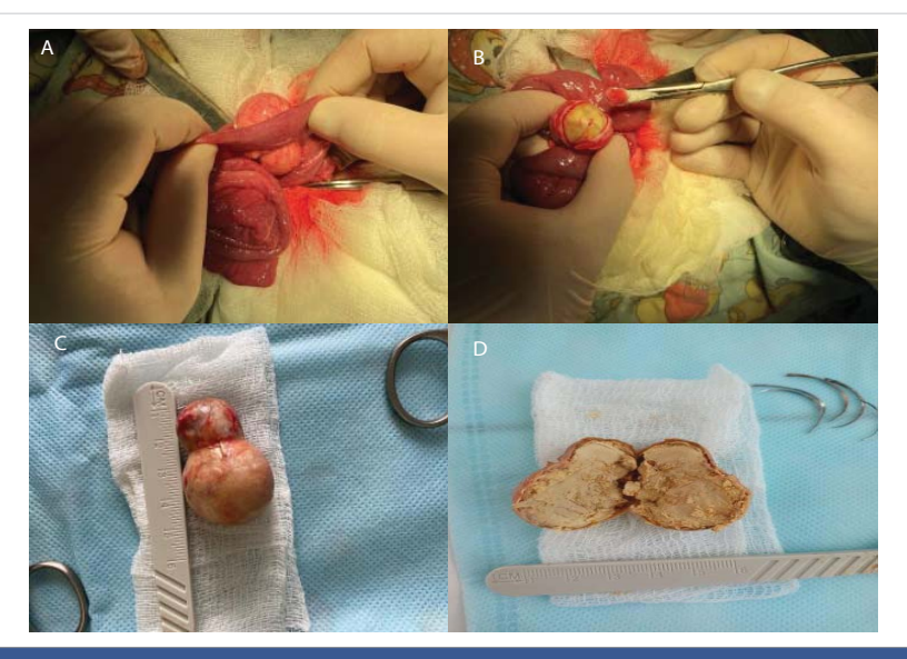
Figure 1: Intraoperative photo: laparotomy, A - surgeon's hands holding a loop of the jejunum with a formation; B - cyst capsule opened; C - view of the removed cyst; D - cyst incised longitudinally.