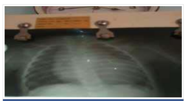
Figure 1: Chest Radiograph showing cardiomegaly (CTR-75%) of left ventricular dominance, right atrial dilatation and lung plethora.

The child was placed on intranasal O2, intravenous antibiotics, isoproterenol, and furosemide with pacemaker implantation and cardiac surgical evaluation kept in view. However, she remained oxygen-dependent and persistently bradycardic (40-60 bpm) throughout admission. Parents signed against medical advice after 1 week of admission despite adequate counseling.