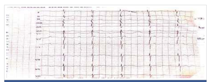
Figure 2: Twelve lead electrocardiogram (ECG) of infant showing a first-degree heart block (ECG of the infant demonstrates prolonged PR interval with sinus bradycardia)), right axis deviation, poor R wave progression and bi-ventricular hypertrophy.