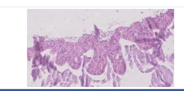
Figure 3: Some projections exhibited more round nuclei and less pronounced bilayered structure. HE staining. 200x.