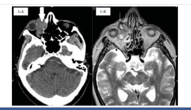
Figure 1: A: Non enhanced axial CT shows bone erosion of the papyracea lamina of ethmoid bone. B: Axial T2 weighted sequence shows an extraconal and intraconal mass (white arrows) in the right orbit, with non-homogeneous hyperintensity ed irregular margins. The lesion involves the nasolacrimal canal, the papyracea lamina and the anterior ethmoid cells.

MRI scan substantiated a T2 mildly hypointense, T1 isointense mass with erosion of the inferior orbital wall.