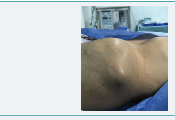
Figure 1: Clinical examination showing the mass of the iliac fossa and the flank.