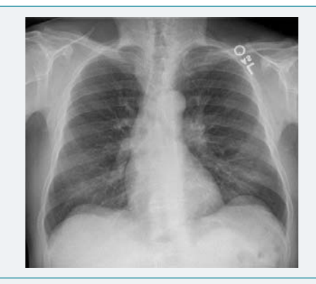
Figure 2C: 10 days after admission showing resolution.

Subsequently, the left hemidiaphragm was found to be paralyzed, likely due to injury of the phrenic nerve during the original incident. The diaphragm has a central tendon with two muscular domes which are divided into three parts; the sternal part attaches to the xiphoid process, the costal part attaches to the internal surfaces of lower six ribs, and a lumbar part that attaches to the three superior lumbar vertebrae. The motor supply of the diaphragm is supplied solely by the left and right phrenic