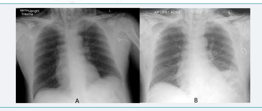
Figure 2: Chest X-ray of the current patient A) in the ED, B) on day 2 of admission showing left hemidiaphragm elevation.