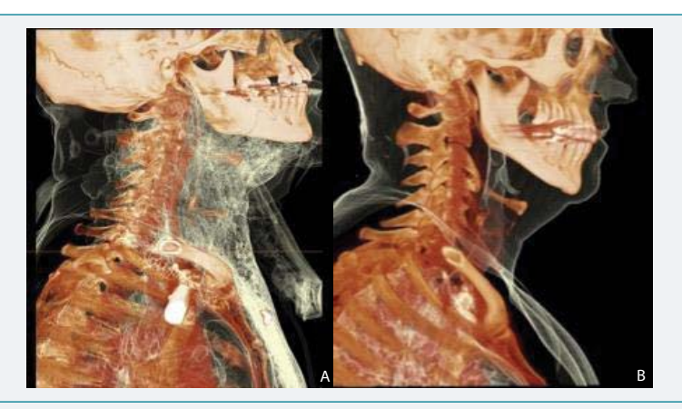
Figure 1: Sagittal 3-D view of the cervical area of A ) the described patient and B ) a normal comparison, as illustrated on the Anatomage Table. Comparison reveals extensive subcutaneous emphysema.

Following initial stabilization in the Emergency Department, the patient was admitted to the Intensive Care Unit for observation given concern for airway edema and compromise. Flexible bronchoscopy under sedation was performed by Thoracic Surgery. A degloving-type injury involving the left lateral aspect of the trachea which covered 25-30% of the circumference of the cartilaginous trachea was found between the second and third tracheal ring. No surgery was recommended. An oral contrast study did not demonstrate an esophageal injury. The patient received supportive care which included supplemental oxygen by nasal cannula, treatments with aerosolized bronchodilators as needed, and wound care.